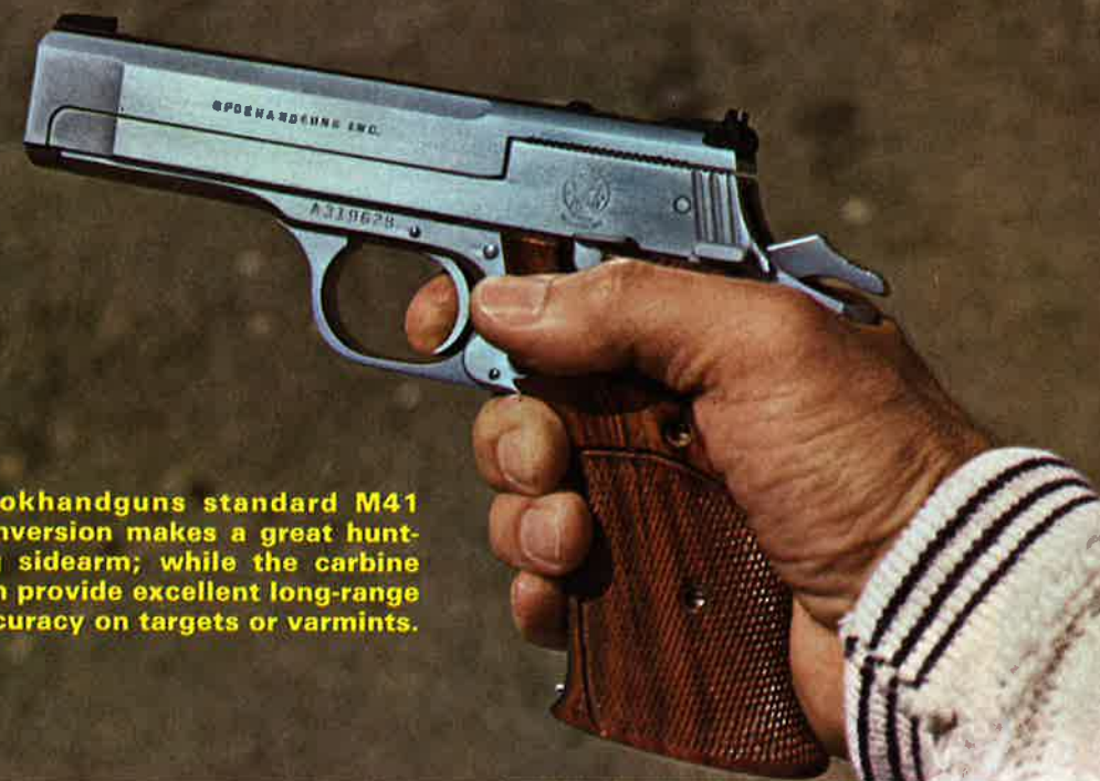
Spokhandguns standard M41 conversion makes a great hunting sidearm; while the carbine can provide excellent long-range accuracy on targets or varmints.